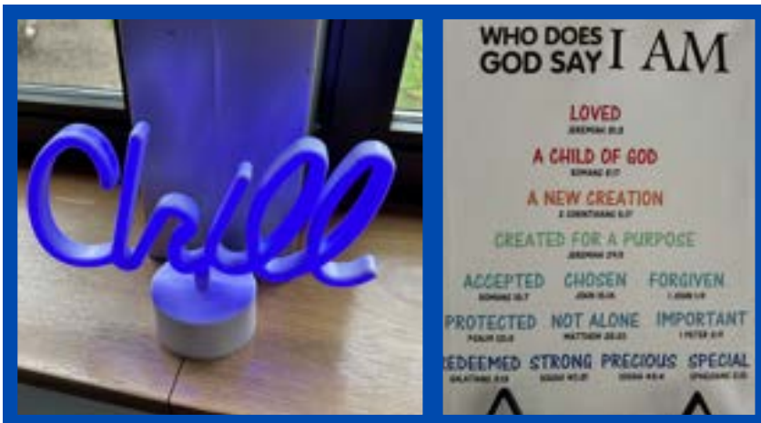
We updated the lounge a bit for use by the Youth Group.